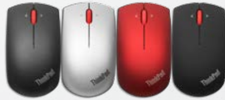
ThinkPad® Precision Wireless Mouse