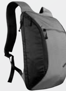
ThinkPad® Ultralight Backpack