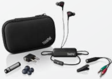
ThinkPad® Noise-Cancelling Earbuds